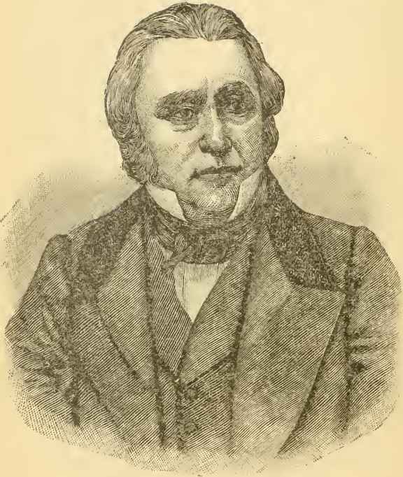
THOMAS BABINGTON MACAULAY.